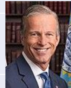
Thune, John - (R - SD) Class III

502 Hart Senate Office Building Washington DC 20510 (202) 224-5842 Contact: www.rounds.senate.gov/contact/email-mike