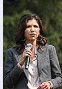
Kristi Noem (R) - January 2019–present January 5, 2019-2023