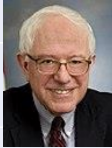
Sanders, Bernard - (I - VT) Class I

332 Dirksen Senate Office Building Washington DC 20510 (202) 224-5141 Contact: www.sanders.senate.gov/contact/